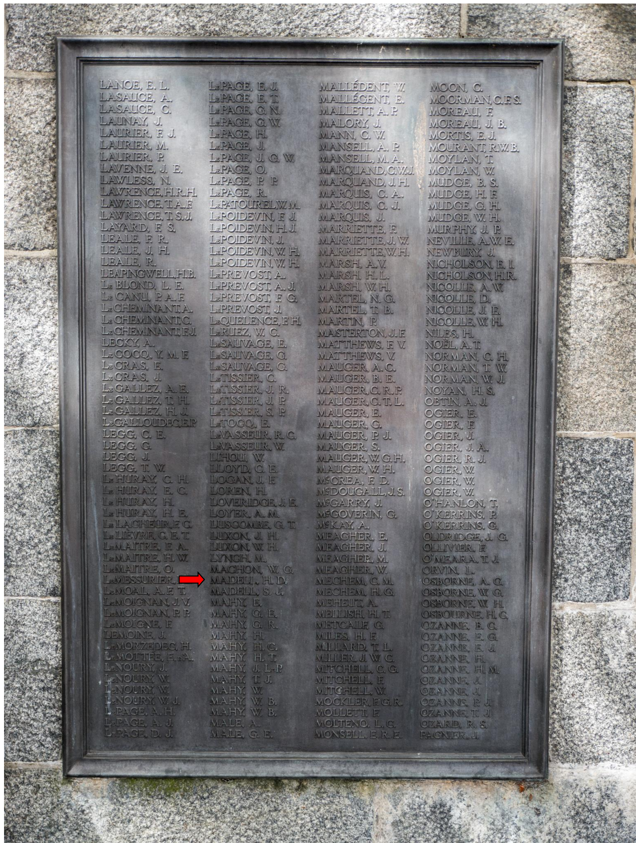
St. Peter Port War Memorial