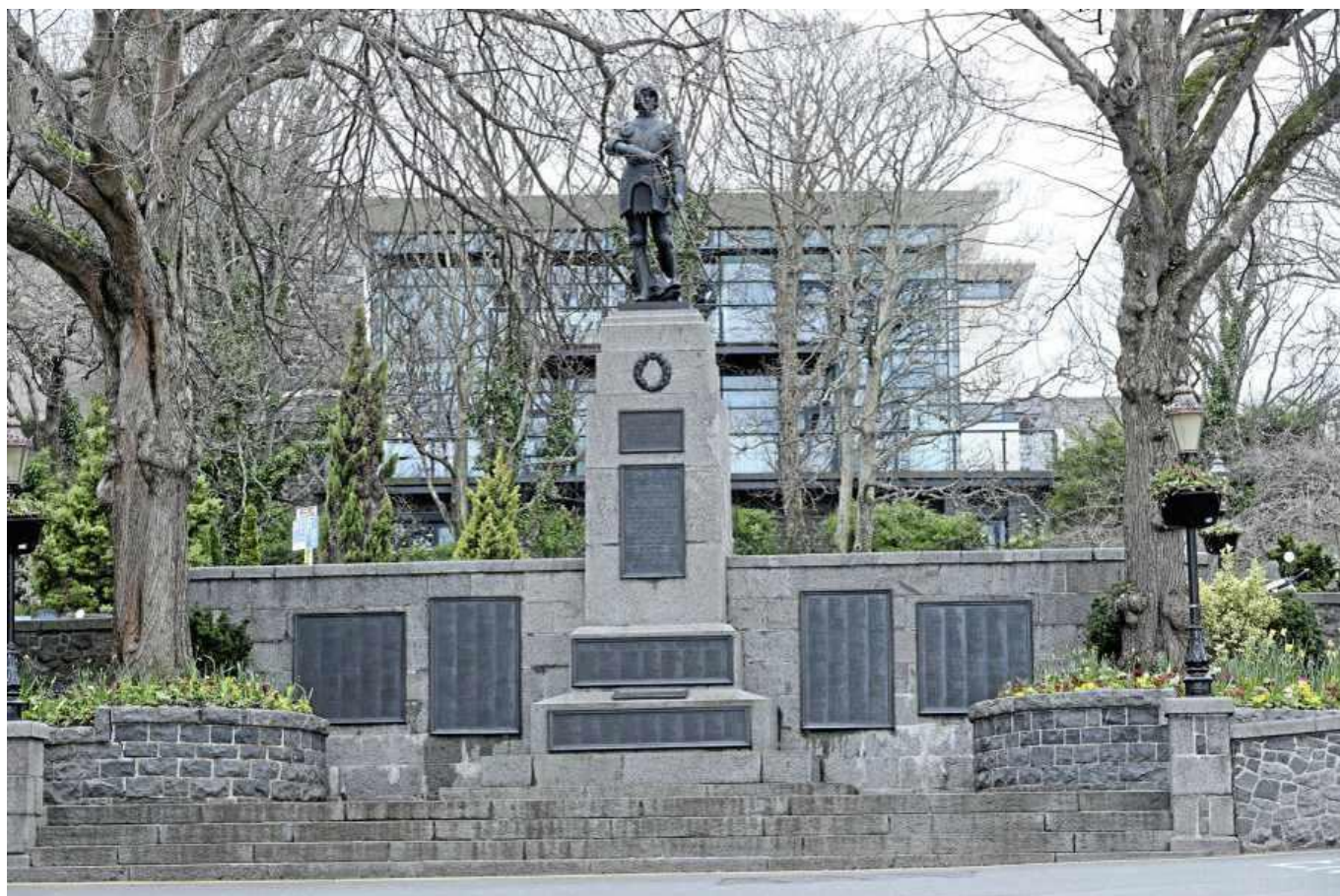
St. Peter Port War Memorial